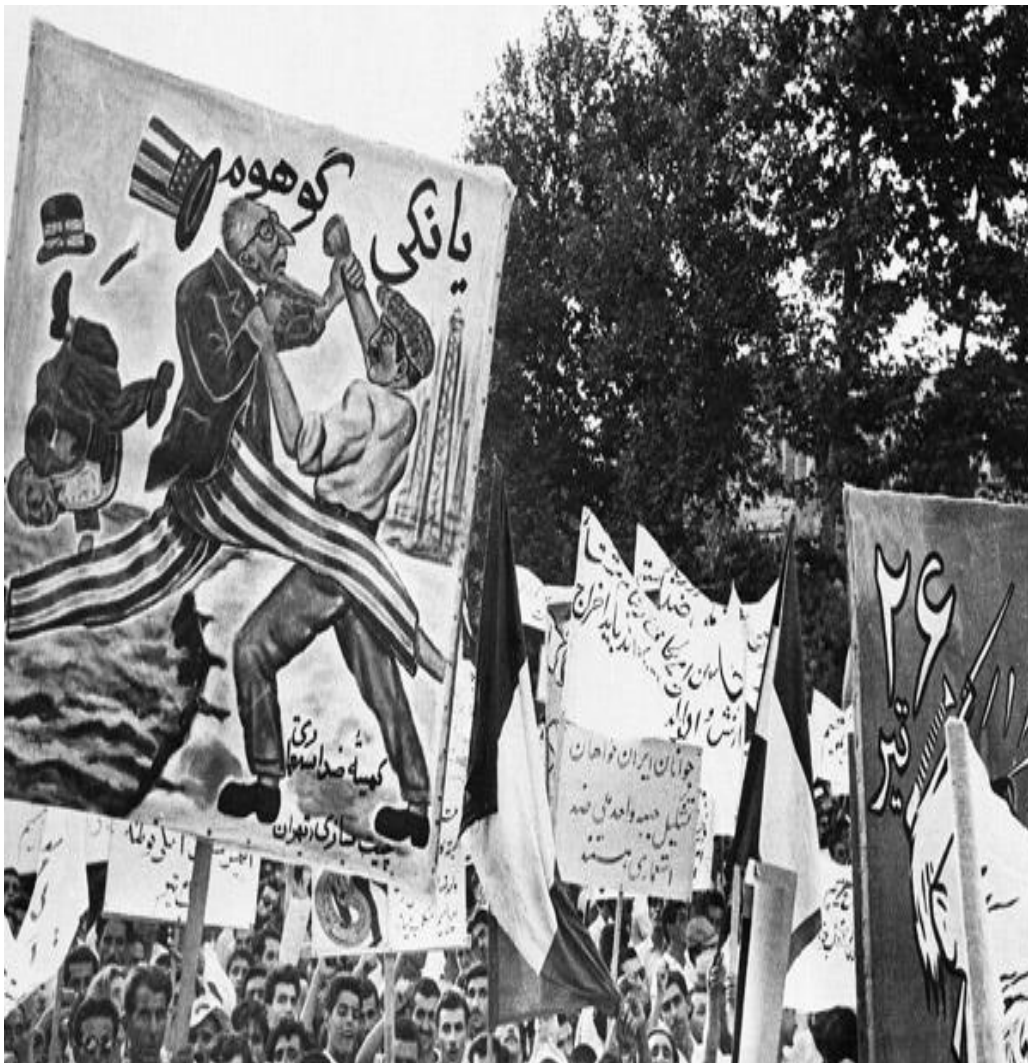
Tehran, July 1953

How can the study of history help us understand current conflicts?