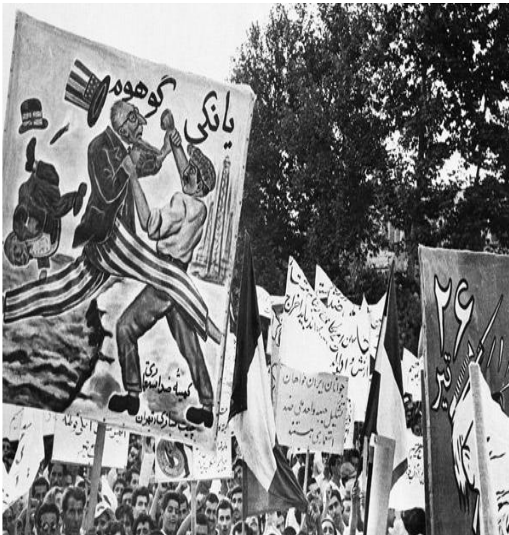
Tehran, July 1953

How can the study of history help us understand current conflicts?